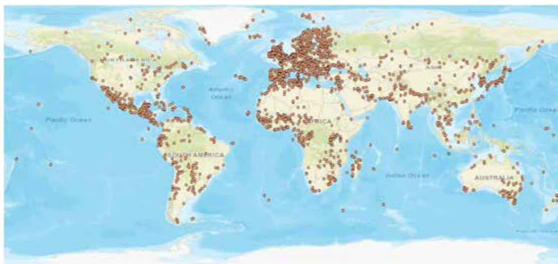
Figure 1.2: Wetlands of International Importance throughout the world.

Ramsar additionally has 15 networks for regional cooperation and four Ramsar Regional Centres for training and capacity building.